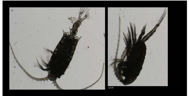
Figure 1. Calanus finmarchicus imaged by FlowCam