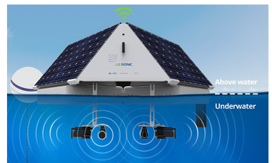
Figure 2. (Right) Ultrasonic frequencies released from buoy into the water to alter algal buoyancy.

Algal blooms have historically been treated by broad applications of an algaecide, such as copper sulfate. Modern technologies, such as ultrasonic buoys (Fig. 2), have been developed and provide preventative advantages for at-risk HAB ecosystems.