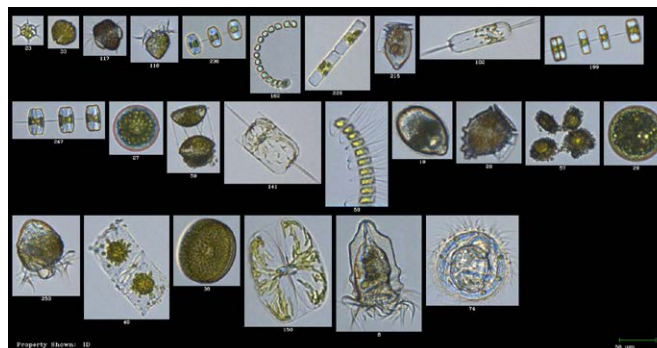
Marine Plankton Sample