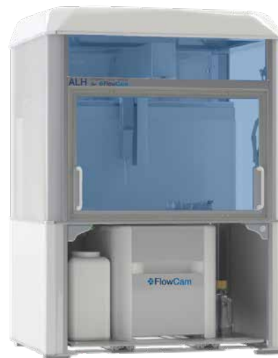
Automated Liquid Handling System by Yokogawa Fluid Imaging Technologies. ALH for FlowCam shown here with integrated FlowCam 8000 instrument.

Automating sample analysis with automated liquid handling enables significant productivity and quality improvements that benefit both users and lab operations. ALH for FlowCam is designed to help laboratories to meet their needs for automation, analysis, and flexibility in flow imaging microscopy and beyond.